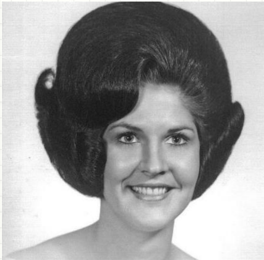
Women's Hair Styles 1969